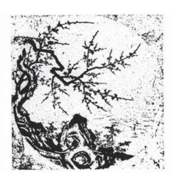
Fig. 9. Returning to the Origin, Back to the Source