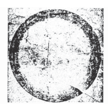
Fig. 8. The Ox and the Man Both Gone out of Sight