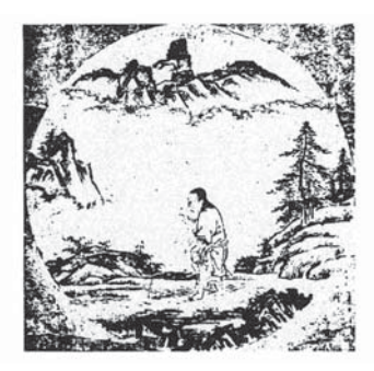
Fig. 2. Seeing the Traces