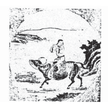
Fig. 7. The Ox Forgotten, Leaving the Man Alone