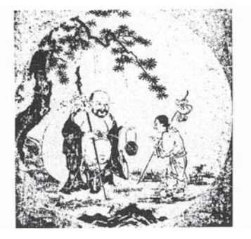
Fig. 10. Entering the City with Bliss-bestowing Hands.