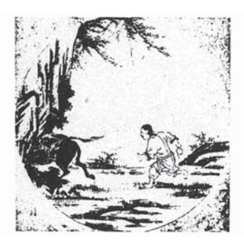
Fig. 3. Seeing the Ox